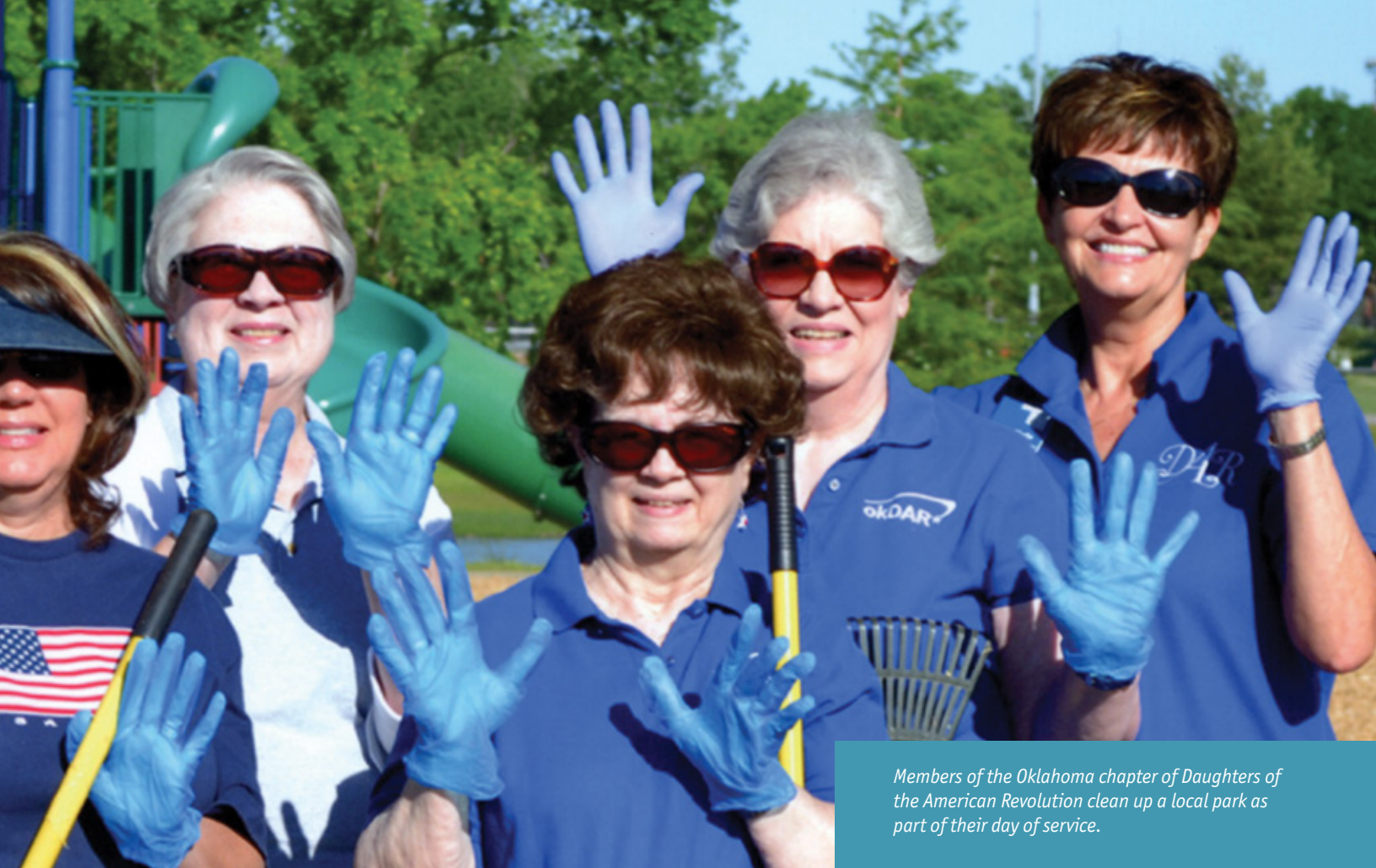
Members of the Oklahoma chapter of Daughters of the American Revolution clean up a local park as part of their day of service.