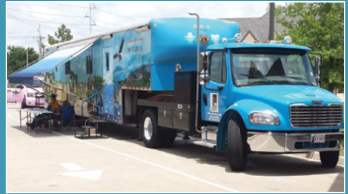
The Oklahoma Lions Mobile Health Screening Unit offers free blood sugar, bone density and general health screening statewide.

As the Oklahoma Lions Service Foundation looks to the future, planned giving has become essential to ensuring that the organization's support continues for generations. Through the organization's legacy giving program, they are encouraging members to consider giving to the organization's endowment fund and work with the Oklahoma City Community Foundation on their estate plans.