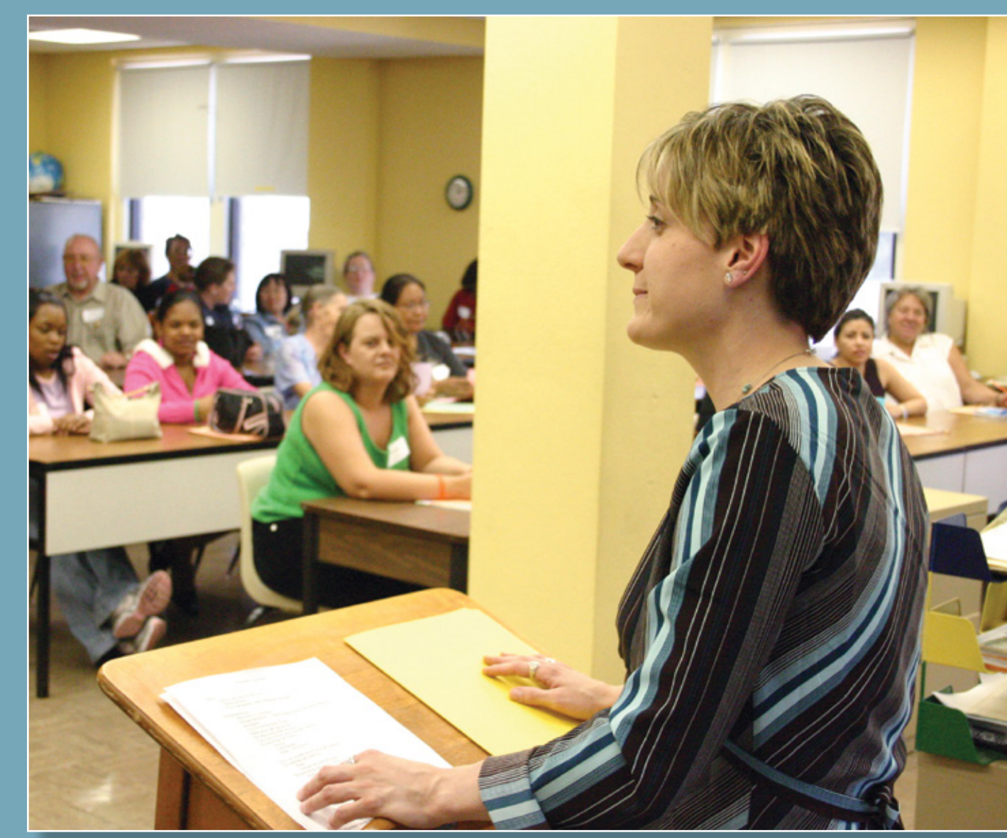
Metro area literacy organizations use both classroom style teaching and one-on-one tutoring to assist adult learners.