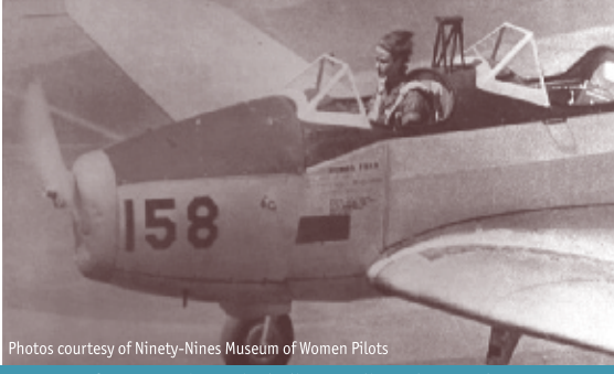
The Ninety-Nines Museum of Women Pilots preserves the historic achievements of women aviators including Amelia Earhart, a charter member of the Ninety-Nines.