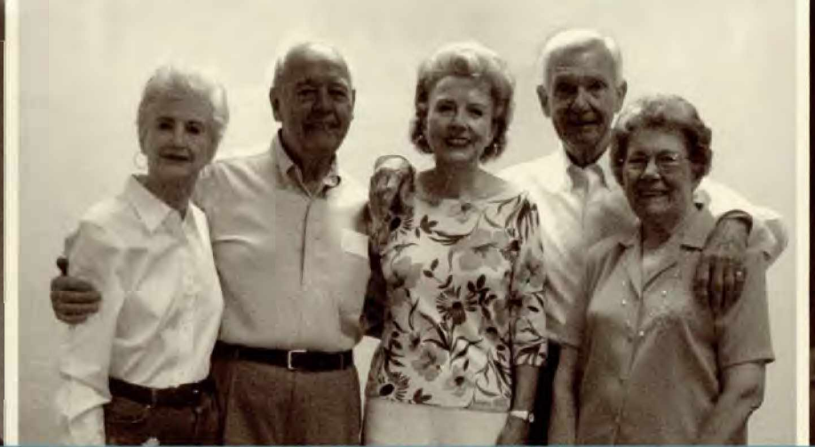
CLASSEN CLASS OF 1945