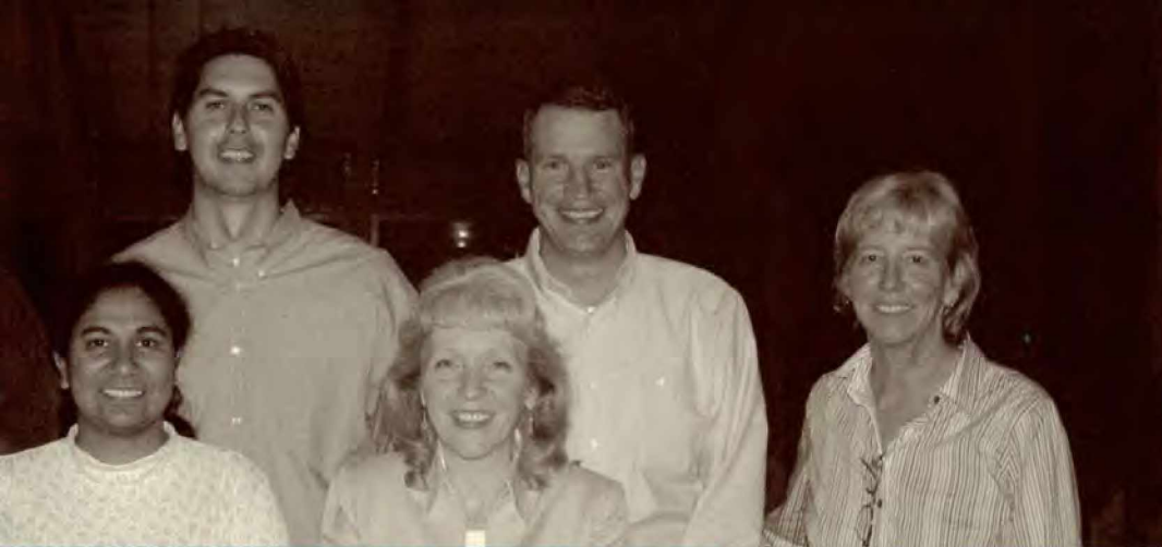
AMERICAN SOCIETY OF LANDSCAPE ARCHITECTS