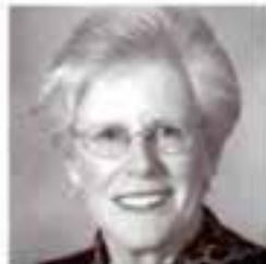
Anna-Faye Rose Scholarships