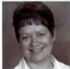
Mary Surbeck Literacy