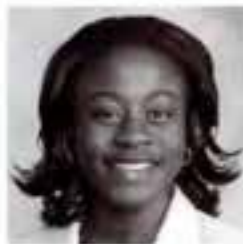
Elizabeth Heard Scholarships