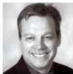
James Bonds Finance