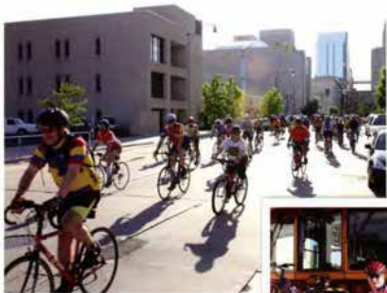
Below, more than 2,000 cyclists participated in the annual Bike to Work Day. Right, Kent Mauk demonstrates the use of a bike rack mounted to the front of a trolley.