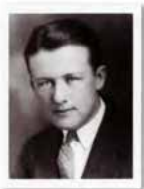
WILLIAM H. TAFT