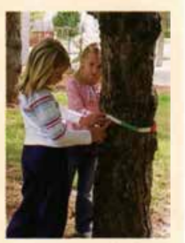
Two elementary students participate in an educational project funded through a Great Grant.

For more information on the Oklahoma City Community Foundation and how we can help you reach your charitable goals, visit www.occf.org or call us at 405/235-5603.