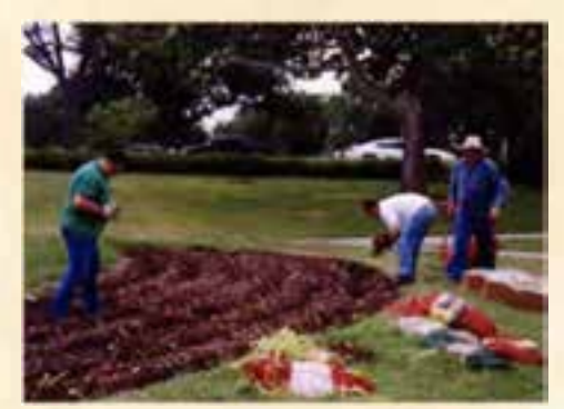
A team of volunteers helped to plant cannas in 22 public parks and medians throughout Oklahoma City

But thanks to a Great Grant from the Oklahoma City Community Foundation, the non-profit organization Oklahoma City Beautiful is addressing