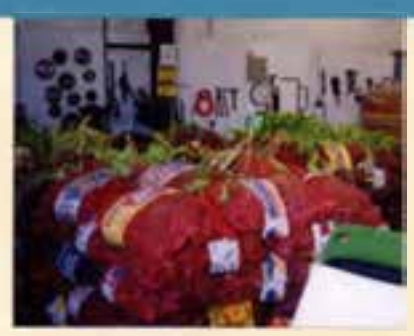
Some of the 22,000 canna bulbs that were donated by Horn's Canna Farm.

The Adopt-A-Park program is now hosting a regular series of free educational seminars to share information on proper maintenance techniques and landscaping issues, creating a much needed network of neighborhood associations and civic groups.