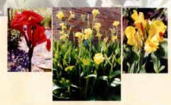
A Great Grant made possible the planting of 22,000 cannas in public parks and medians throughout Oklahoma City.

Let the Oklahoma City Community Foundation help you help the community. For additional information, contact us at 405/235-200 or visit www.occf.org