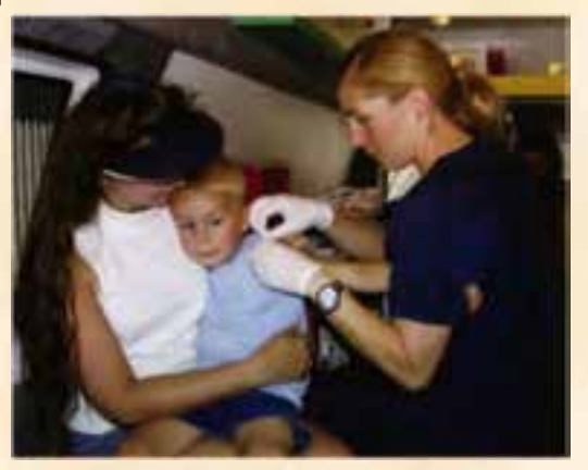
A young boy receives a vaccination from a registered nurse aboard a Caring Van.

Childhood vaccinations are critical in preventing diseases, disability and death but too often children in low-income families don't have the proper access to these lifesaving immunizations. As a result, these children face serious health risks. Thanks to a recent Great Grant from the Oklahoma City Community Foundation, more than 1,100 children in Oklahoma County have received free immunizations through the Oklahoma Caring Foundation and its Caring Van Program.