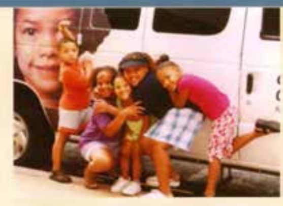
The Caring Van Program provides critical vaccinations to children in Oklahoma County.

The Oklahoma Caring Foundation, a non profit organization, was formed by Blue Cross Blue Shield in 1994 to benefit economically disadvantaged Oklahoma children through preventive programs addressing their access to health care. Its Caring Van Program is doing just that and the Oklahoma City Community Foundation is pleased that a Great Grant was able to help more than 1,100 children in Oklahoma County lead healthier lives.