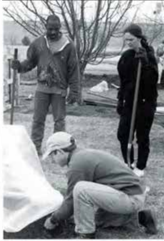
Volunteers work together to plant a demonstration garden at the Horticulture Center.

of grants were approved this February, with a range of organizations desiring a garden. Selection United Methodist Church, Capitol View Neighborhood Association and Mayfair Center, a senior citizen's center, all received start-up assistance through this program.