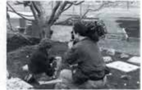
KWTV - Channel 9 covered the community gardening event.

In support of the initiative, a grants program was established. The first round