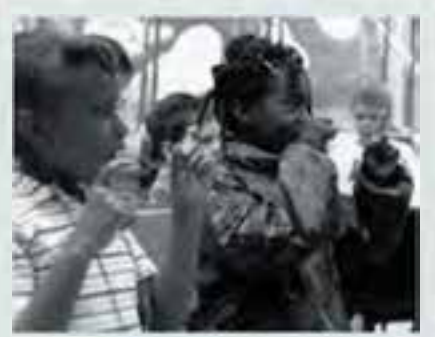
Children at Britton Elementary enjoy an interactive lesson in rhythm.