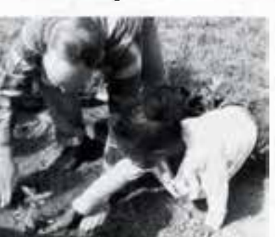
A student helps plant a seedling.

The Capitol View Neighborhood community garden (N.E. 29th and Laird) was dedicated on May 21. The neighborhood