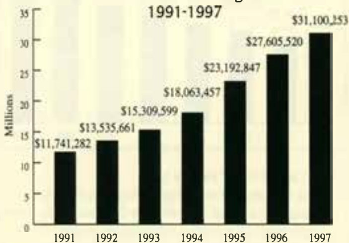
Growth of Net Assets in Designated Funds 1991-1997