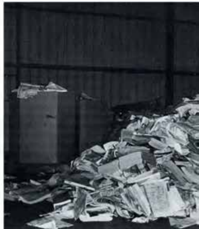
This pile of telephone books will be recycled as part of Oklahoma City Beautiful's project called Project Redirectory.

Page 31 of the 1991-92 Yellow Pages gives numbers to call about environmental concerns. A recycling coalition composed of businesses and other organizations is in the discussion stage at this writing. Other projects are in the works to make Oklahoma a cleaner and more beautiful place to live.