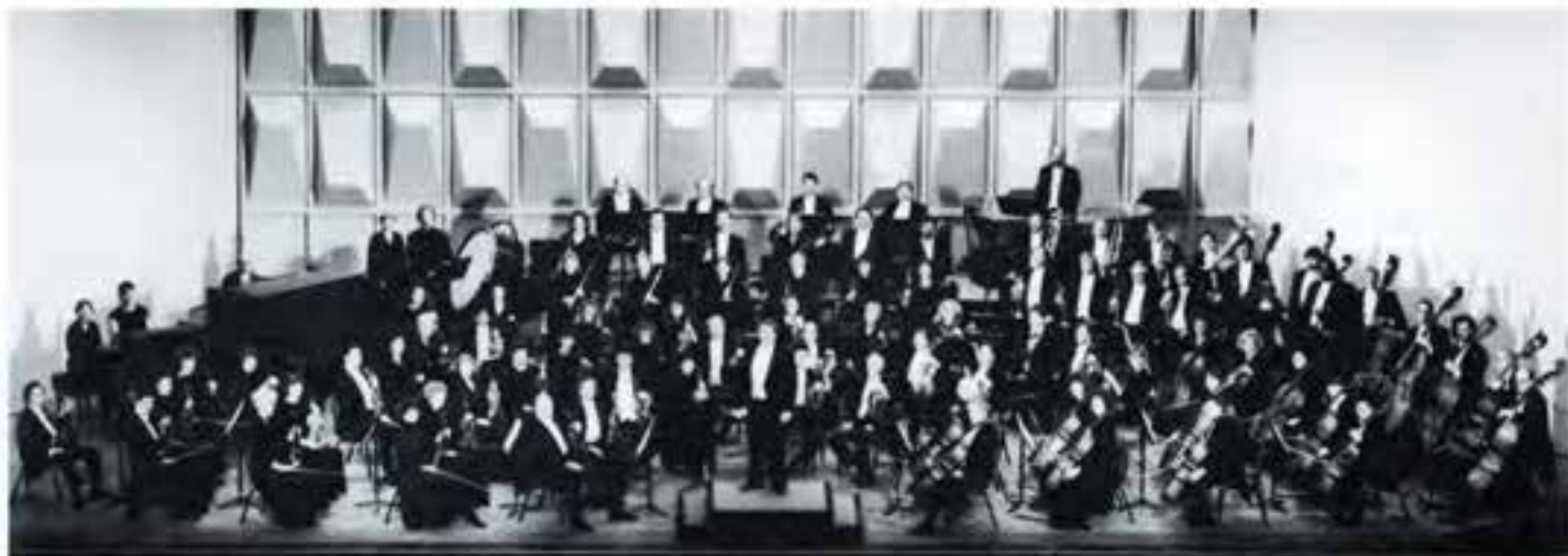
The presence of the Oklahoma City Philharmonic Orchestra adds much to the cultural climate of our community.