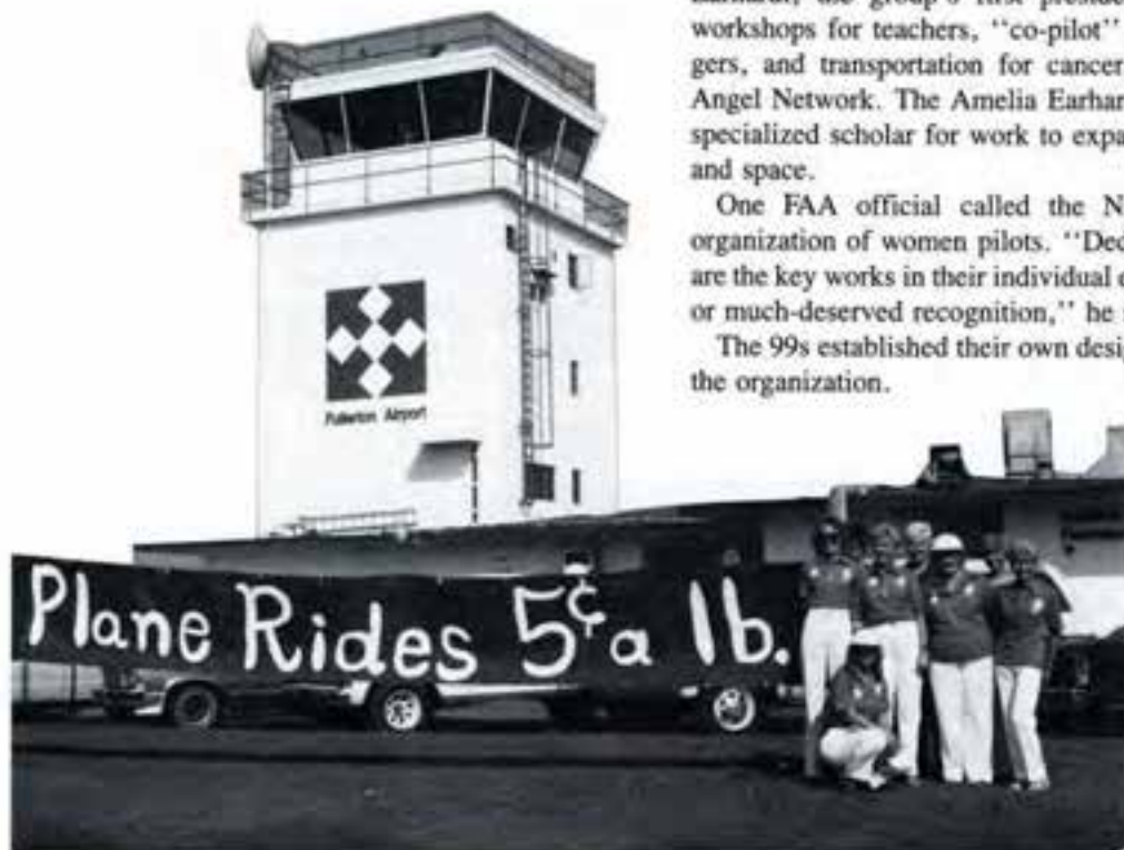
At five cents a pound the average passenger would pay $7.50 for a ride at this Ninety-Nines fund raising event for the support of their many philanthropic efforts.

The 99s established their own designated fund to provide future income for the organization.