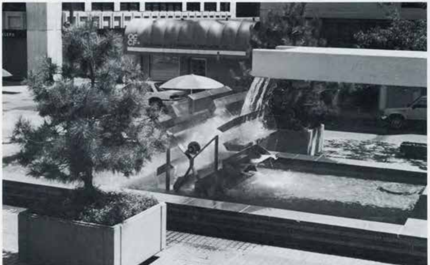
Since 1985, the Oklahoma City Community Foundation has been housed at 115 Park Avenue, a one-story building located just south of Kerr Park in downtown Oklahoma City.