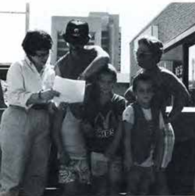
One of the many functions of Travelers' Aid Society of Oklahoma is to help travelers reach their destinations.