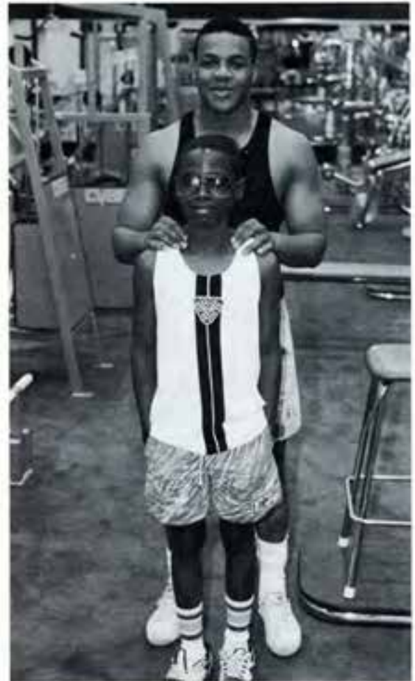
This Big Brother and his "Little" do workouts together.