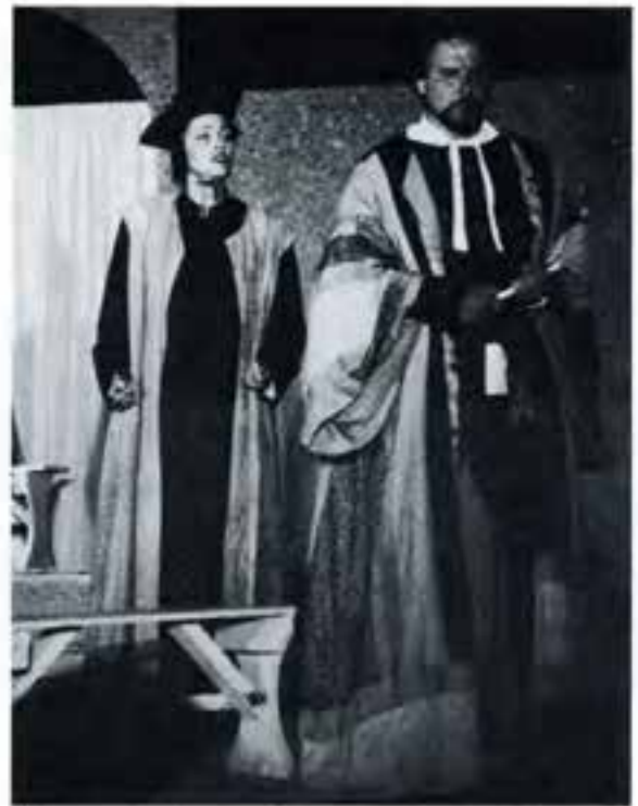
Shakespeare's timeless themes return to Edmond's E.C. Hafer park every summer.

Productions are also brought to communities throughout the state. Next year the schedule includes "As You Like It," "Troilus and Cressida," and "Henry V."