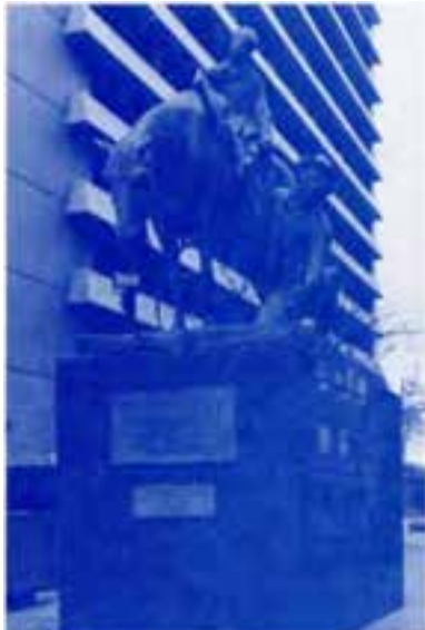
Located in Kerr Park, the statue honoring the pioneers of 1889 was used for the cover photo of the twenty-year book.

The publication of "A Twenty-Year Stake in the Community" marks the twentieth anniversary of the Oklahoma City Community Foundation. The twenty-year book features the history of the Community Foundation and compares it with the Land Run's Centennial.