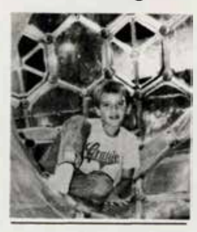
A child plays in the crystal bubble at the Omniplex.

The Oklahoma City Community Foundation's Board of Trustees approved eight grants totaling $38,000 at the February, 1989 meeting. Nominees were selected by the Grants Committee from twenty-one applications received by the December 31, 1988 deadline.