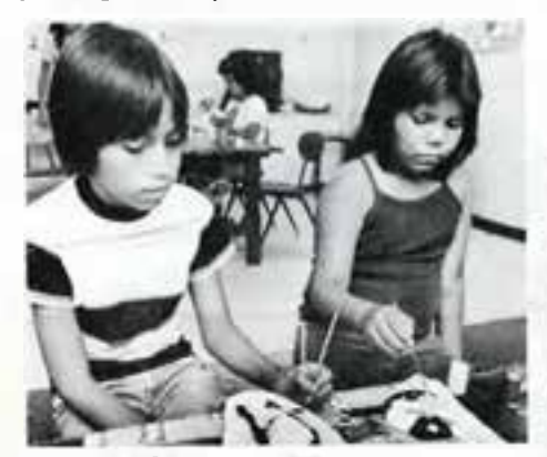
The Daily Oklahoman, Aug. 8

For the second consecutive year, OCCF has made grants for special projects in an effort to be more responsive to community needs. This year's grant recipients were: