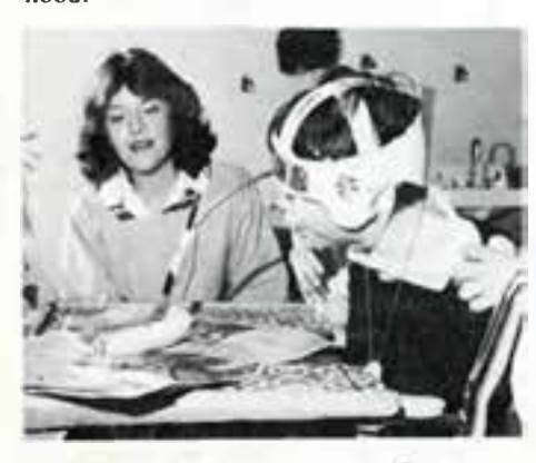
Foundation for the Disabled: $1,900 to underwrite part of the cost of summer programs in art, music and recreation.

Arts Council of Oklahoma City: $2,000 to provide a constructive arts program to help alleviate the severe drug abuse problem among adolescents in the Willard Neighborhood.