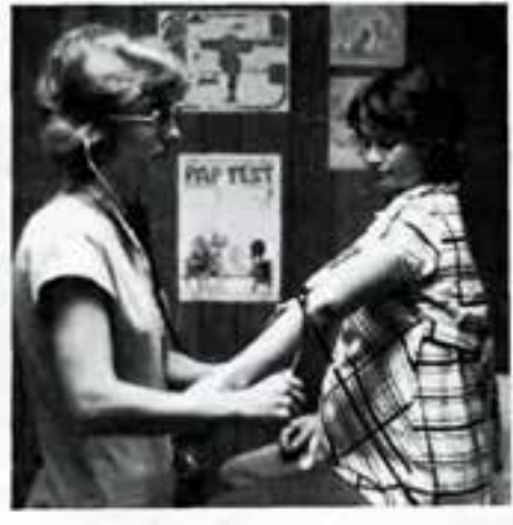
Neighborhood Services Organization Clinic: $1,250 for medical and dental supplies for low-income patient care.

Native American Center: $1,000 to provide a summer program of education, culture and recreation for youth.